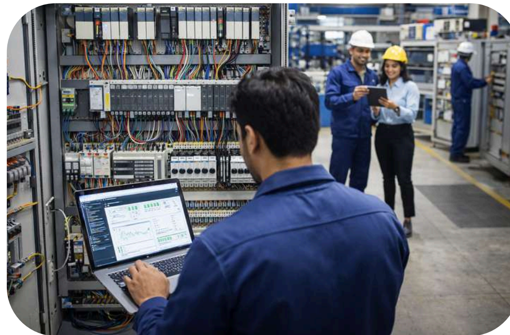
Digital Engine Rooms