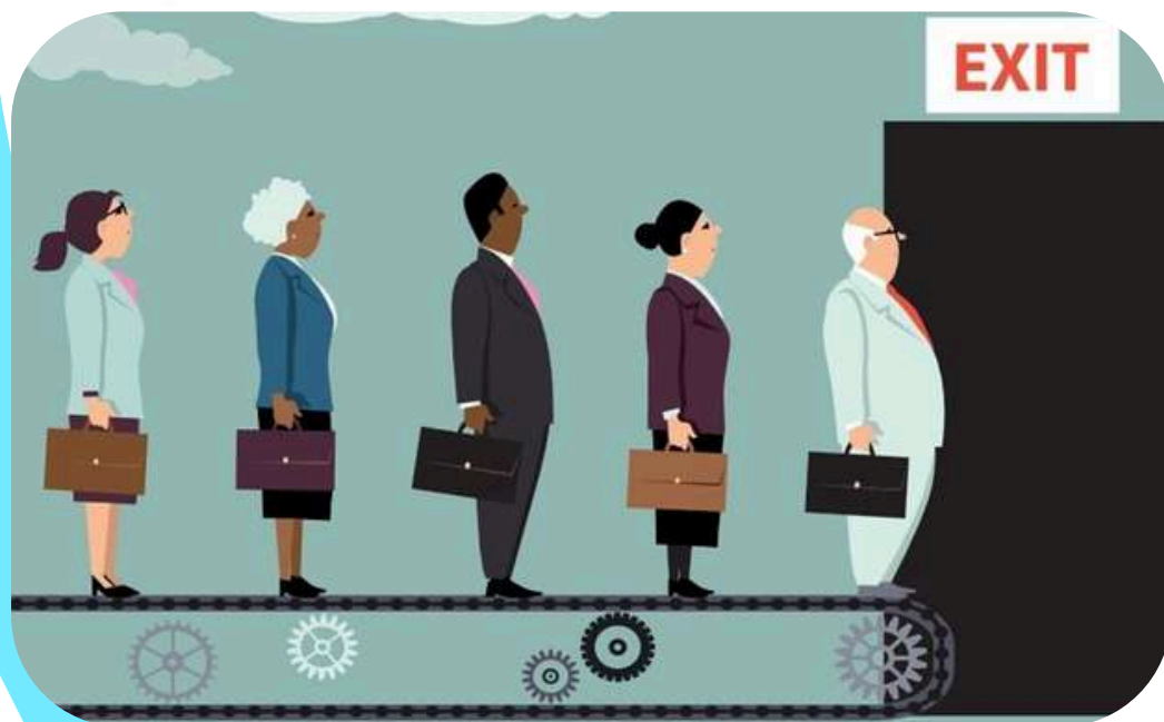
Aggressive talent drain